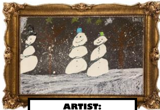
ARTIST: EMILIO MORALES