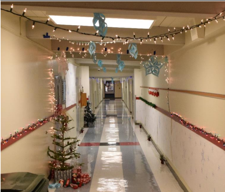
The Middle School "Decked the Halls" - winning the class competition was the 6th graders!