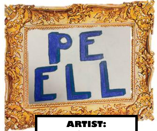
ARTIST: LONDON WARD