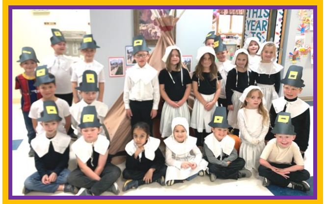
1 st grade dressed as Pilgrims.