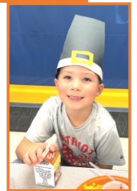
2 nd grade dressed as Indians & Pilgrims.

IMMANUEL LYF HOLIDAY BAZAAR will be held on Sat., Dec. 9 at ALIS from 9am to 3pm. There will be 25+ vendors and LYF gift wrapping.