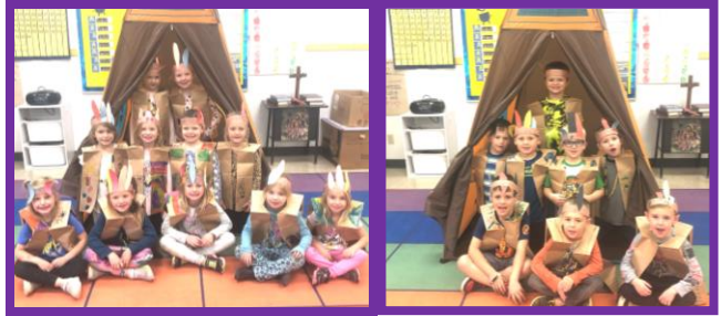
Kindergarten dressed as Indians.