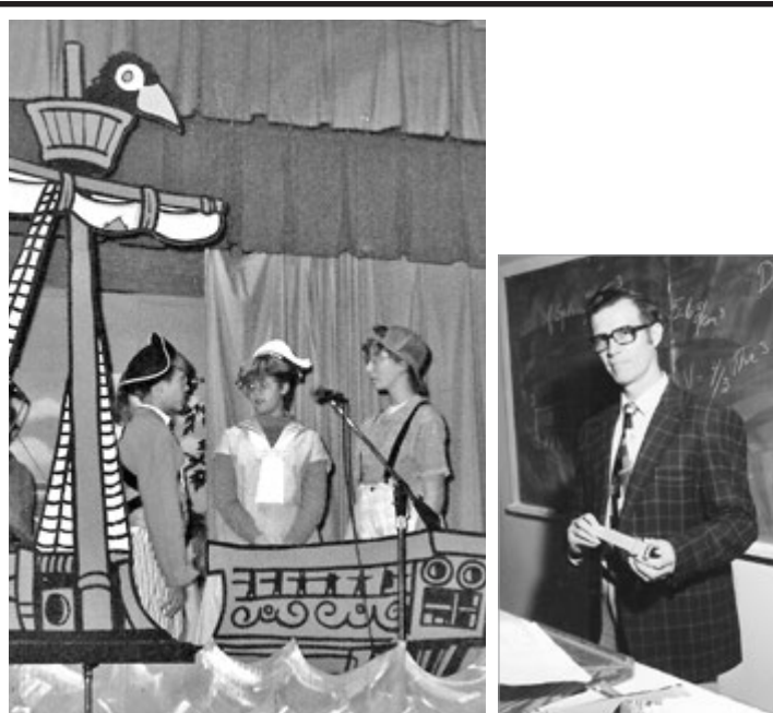
(Left) As our elementary students prepare for this year's Patch the Pirate musical (details on pg. 1), we're flashing back to NC elementary's very first Patch the Pirate musical, The Misterslippi River Race , during the 1989-1990 school year. If you can identify any of the students pictured, you could win a prize. Send your guesses to advance@nebraskachristian.org .