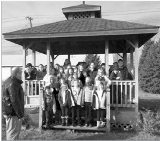
FA-LA-LA-LA-LA The elementary spent an afternoon Christmas caroling at several places around town. Their stops included Dairy Queen, Waffles-n-More, the gazebo, and Cottonwood Estates.