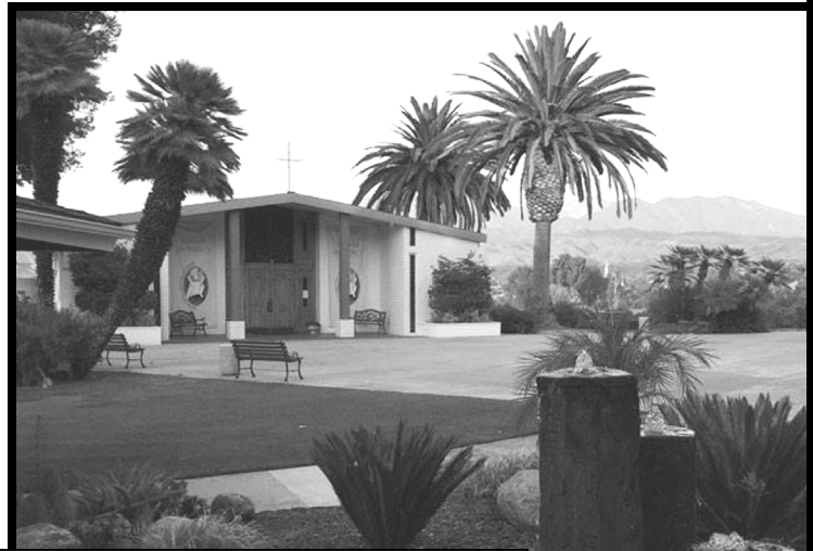
These three photos are from the 2017 Avila Young Adult Retreat