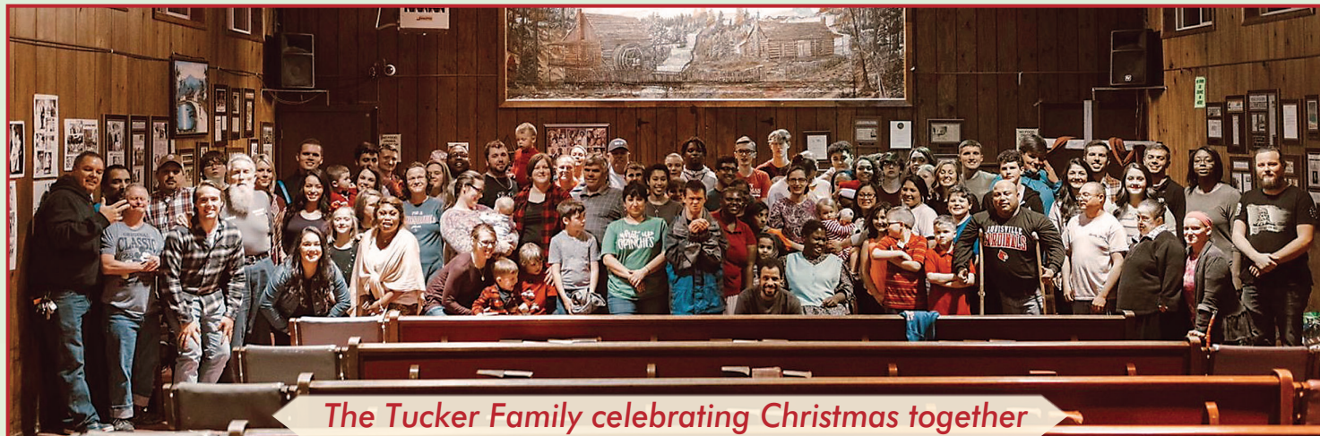
The Tucker Family celebrating Christmas together