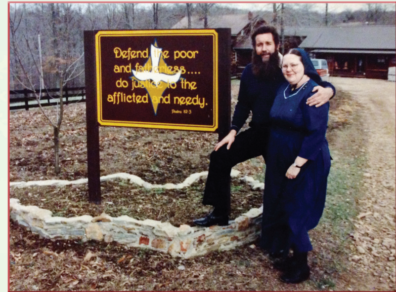
Dad & Mom standing out front in the mis 80s with our Psalm 82:3 sign