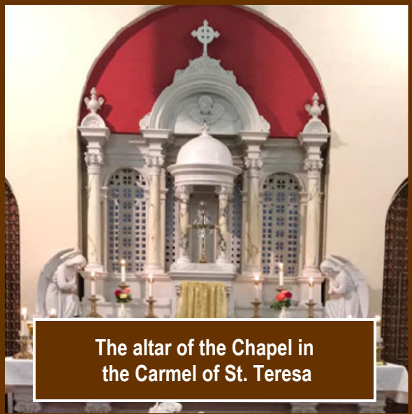
The altar of the Chapel in the Carmel of St. Teresa