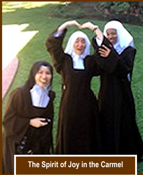
The Spirit of Joy in the Carmel