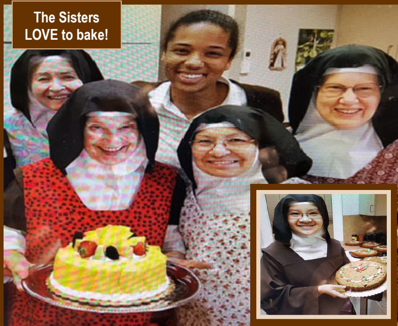
The Sisters LOVE to bake!