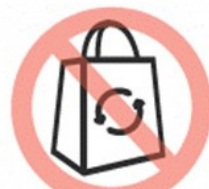
Reusable grocery tote