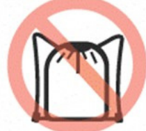
Solid color cinch bag