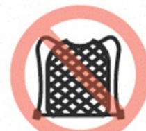
Mesh or straw bag