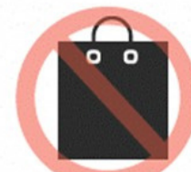
Large tote bag