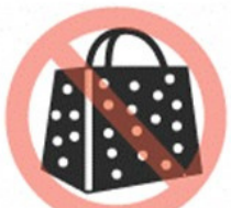
Printed patterned plastic bag