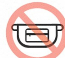
Large fanny pack