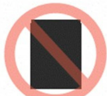
Colored plastic storage bag