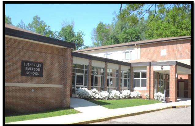
LLE – 15 Columbus Road