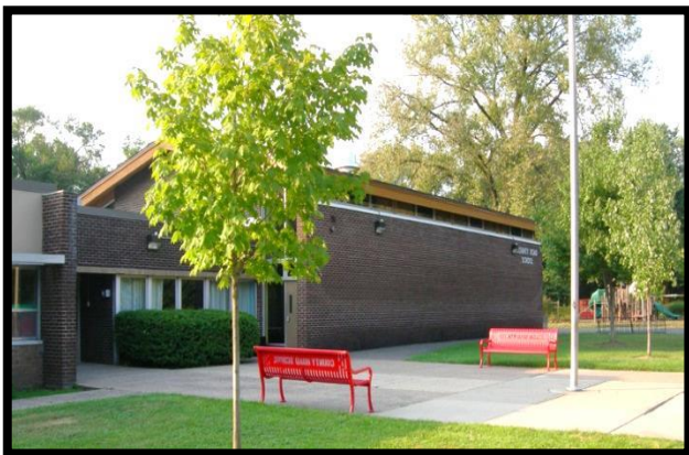
CRS – 130 County Road

From there, you can click on SCHOOLS to navigate to CRS/LLE