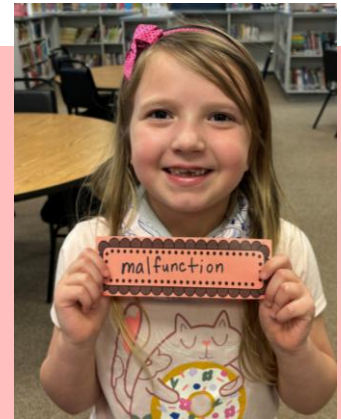
"Malfunction – To Quit Working."

FALLING IN LOVE WITH VOCABULARY... YOU KNOW YOU'RE ON TRACK WHEN STUDENTS START BRINGING IN WORDS FROM HOME!