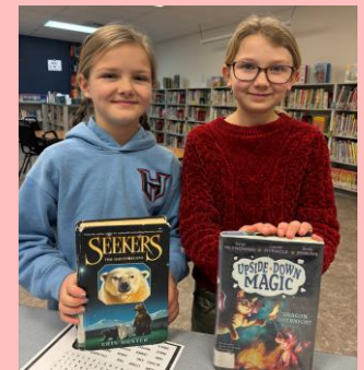
Girls who love their books!