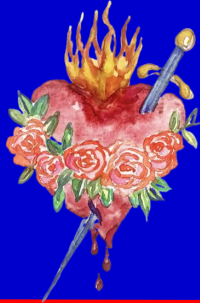
Five First Saturdays