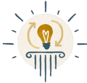
ONGOING PROFESSIONAL GROWTH