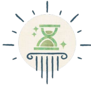
EXPLICIT INSTRUCTION, INTERVENTIONS, & EXTENSIONS