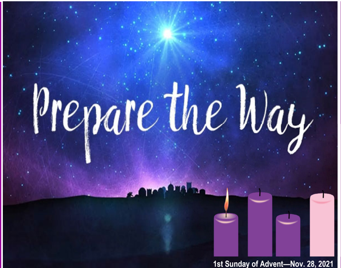
1st Sunday of Advent—Nov. 28, 2021

So Pilate said to Him, "So then you are a King?" Jesus answered, "You say I am a King. For this I was born and for this I came into the world, to testify to the truth. Everyone who belongs to the truth listens to my voice." (John 18:33-37)