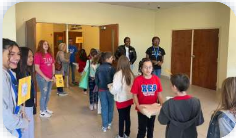
TAAP Ambassadors greet and help direct 3 rd graders as they arrive to the Marketplace.