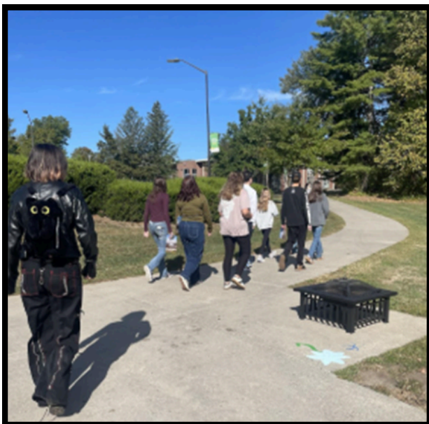
Senior walking on the SUNY ADK campus tour

In September, Seniors went to SUNY Adirondack for a campus tour. While there, students were able to complete the application for immediate college acceptance. This is a crucial step for students making significant decisions about their future. College is an option, and with automatic acceptance, students don't have to worry if they get in or not. While some may choose to go to SUNY Adirondack, others might find a better fit somewhere else. Still others may find employment. This tour helped show students what college life can be like and the many opportunities they may have if they choose a post-secondary education pathway.