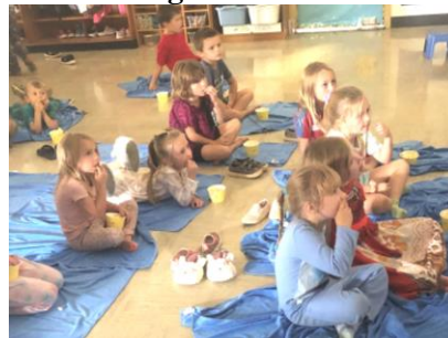
This week they studied the letter "P". They wore their pajamas to school and watched a movie and ate popcorn.