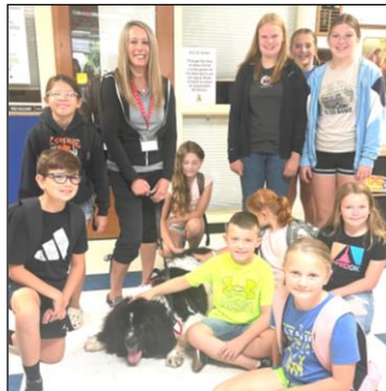
On Sept. 6 students were greeted by Moose, a purebred Newfoundland that has been trained as a therapy dog. Moose will visit ALIS again on Wed., Oct. 4.