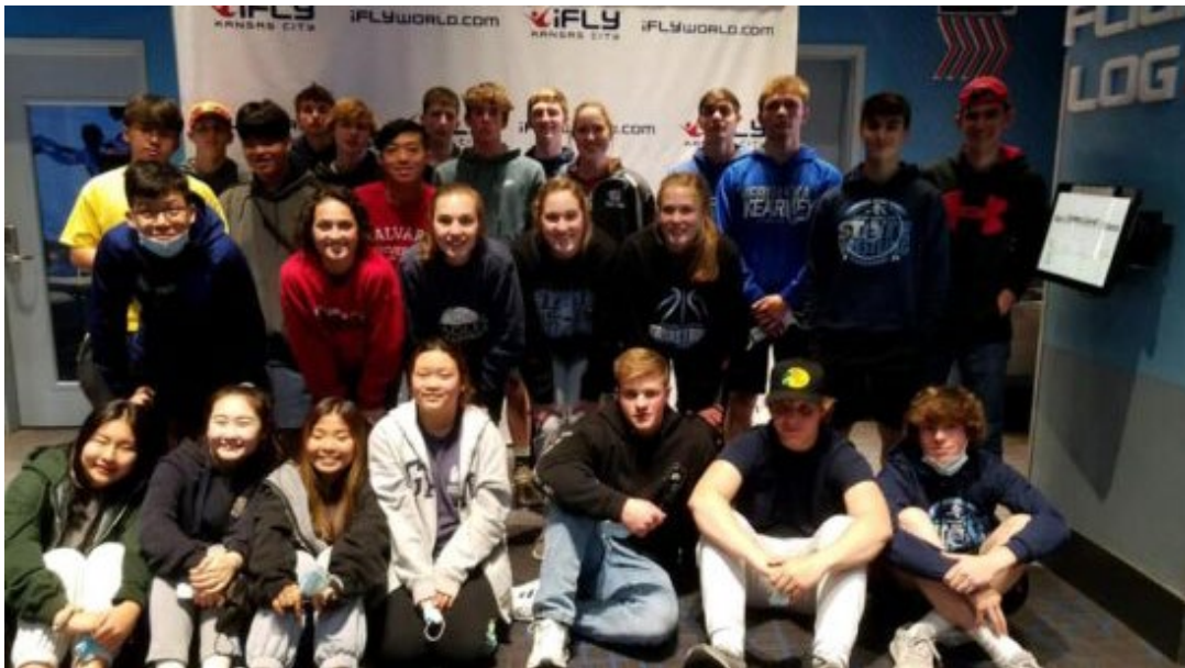
The entire junior class experienced high-flying fun at iFly on the junior trip.