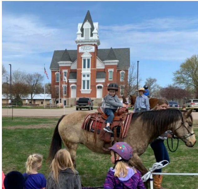
One of NC's homeschooled guests perches atop Missy the horse during her pony ride at the petting zoo.