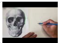
Drawing a Human Sk... YouTube video • 46 minutes

This drawing cannot be completed in a single class period.