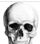
Skull 1.jpg Image