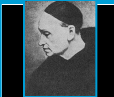
St. Raphael Kalinowski OCD

Feast Day: November 15 (September 1, 1835–November 15, 1907)