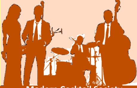
Modern Cocktail Society