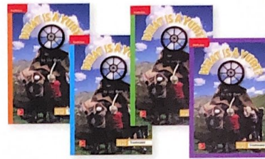
What Is a Yurt? (Approaching, On Level, Beyond, ELL)