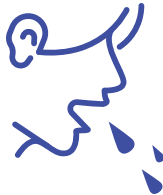
Nausea or Vomiting