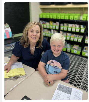
Welcome to our class new friend!