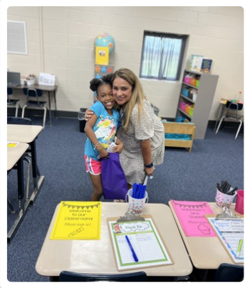
A Familiar face from last year!

It was great seeing all of our NES students and families during our Meet and Greet on July 28, 2022. This year, we also welcomed some new students and teachers to our school! We're so excited to see some new and returning faces to NES. Students met their new teachers and learned about changes for the upcoming school year, bus routes, and our after-school programs. Please enjoy the photos below and on ClassDojo from our event!