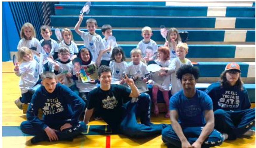
Picture of Miss Flock's TK class cheering on their senior friends at the senior pep assembly for our wrestlers.