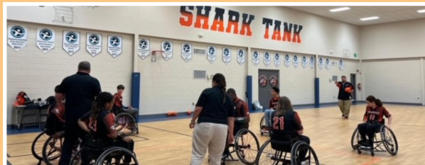
The Houston County Sharks practicing in their own Shark Tank