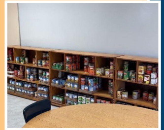
Food Pantry is stocked