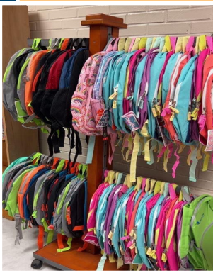
Resource Room is ready