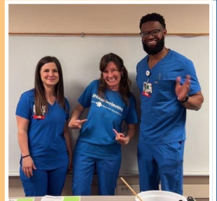
Houston Healthcare Cooking Class Instructors