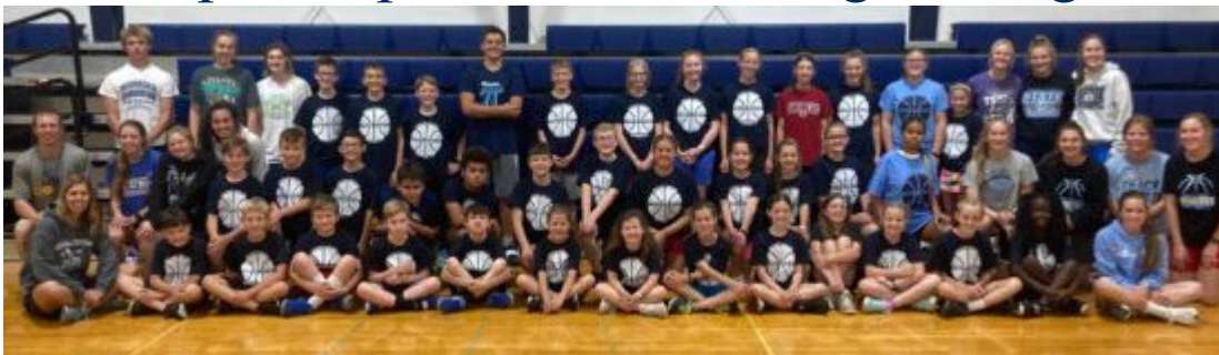
A great group of 5th-8th graders turned out for Junior Eagles Basketball Camp.