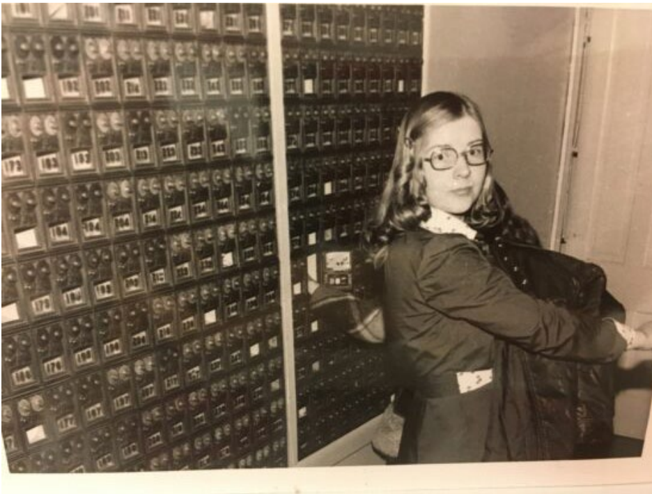
Can you identify this NC student who has just gotten her mail? If you can, email her name to nc@nebraskachristian.org with the subject line "NC Flashback."