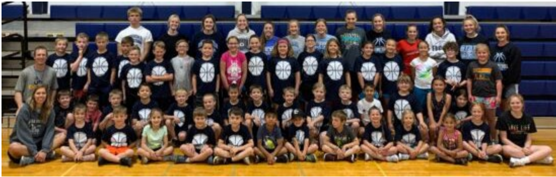
These K-4th grade Junior Eagles loved their time at Basketball Camp.

School may be out, but the campus is still bustling with activity. It recently welcomed elementary students back for three different athletic summer camps.