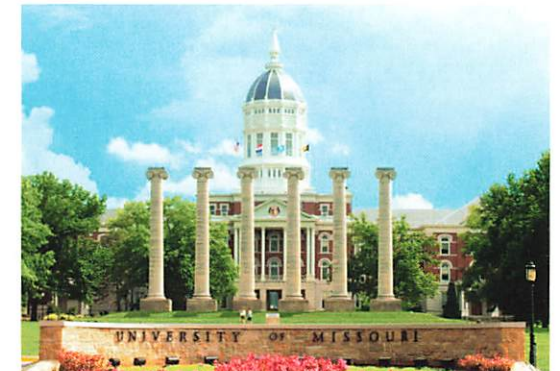
University of Missouri-Columbia

Free Workshops, Free Brokerage Accounts, and Free Study Abroad provide recipients with a practical understanding of important life skills not typically covered in the school curriculum.