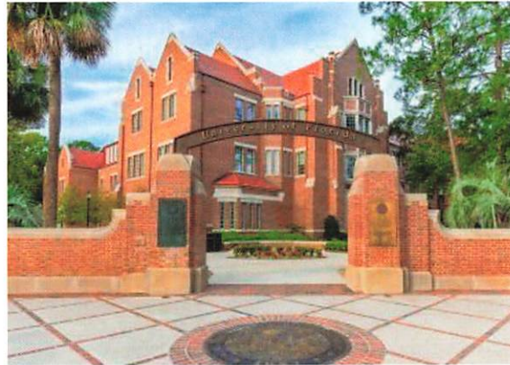
University of Florida