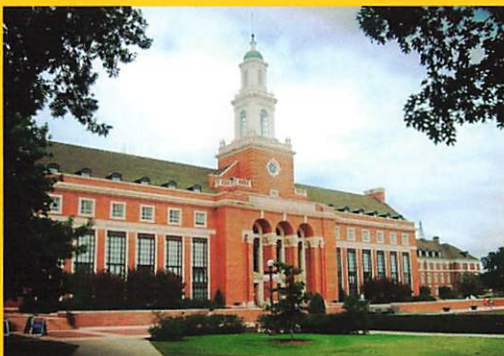
Oklahoma State University

"You can't go back and change the beginning, but you can start where you are and change the ending." C.S.Lewis