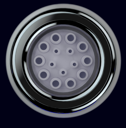
7" H<sub>2</sub>0 PowerFlow Footblaster