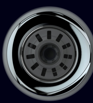
5" H<sub>2</sub>0 PowerFlow Hydro Extreme