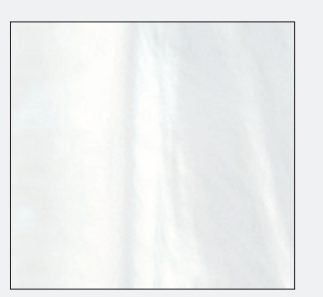
MARBLE, Silver Marble**