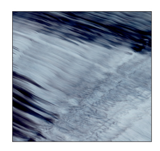
LUSTER SWIRL*, Storm Clouds