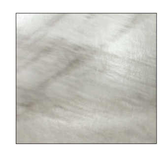
METALLIX*, Glacier Mountain**