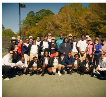
Our St. Pius 8th graders and all of our tennis participants!

I would also like to thank the Haskell Company for hosting the Awareness Reception for the friends of the Guardian. The evening included live and silent auctions featuring exciting trips, artwork by Guardian students, and the chance to golf with some of your favorite celebrities at the golf tournament the following Monday. Thanks to the Haskell Company for a beautiful reception for our donors and friends. We greatly appreciate all of you at the Haskell Company! Our Golf and Tennis Classic has provided us with so much success in the past 12 years and we are excited to announce that we have already set a date for our 13 th Annual Golf Classic. Next year's event will be held on March 6, 2017 at Deerwood Country Club. Each year we look for new ways to continue growing with this tournament and we decided that combining our two annual events (the Golf Classic and the live and silent auction) could be a great idea for next year. So, we are excited to announce a one day event that will feature our live and silent auction immediately following our Golf tournament this year at Deerwood Country Club. So please, Save the Date!