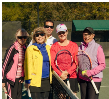
A few of our tennis teams gearing up for their matches!