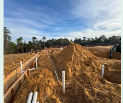
NEW SCHOOL CONSTRUCTION CUP Foundation Forms and Plumbing Rough In