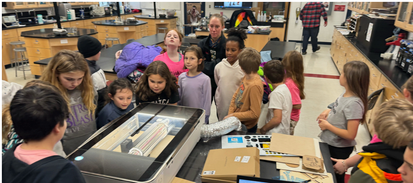
Fourth graders designed and used the laser cutter to create holiday ornaments for their loved ones.