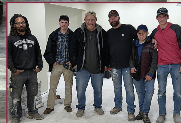
The wonderful crew doing the work in our Girls' dorm