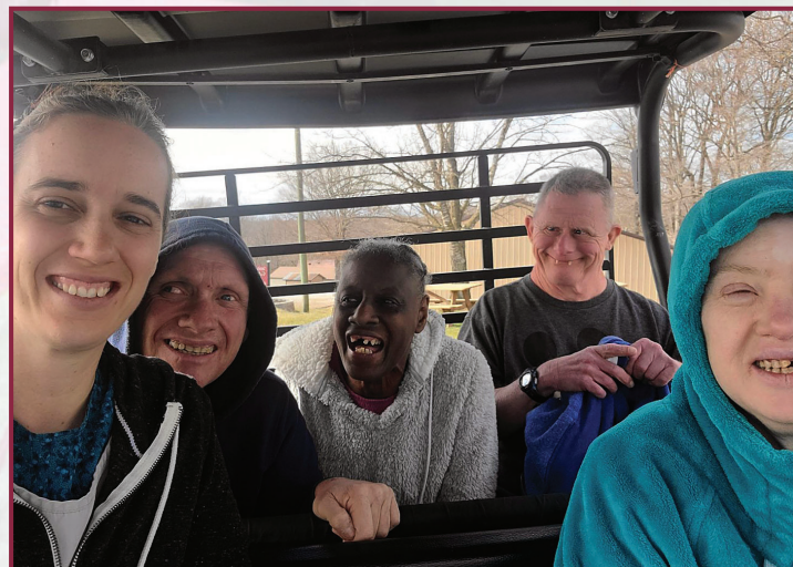
Eria taking a few residents on a mule ride

GALILEAN CHILDREN'S HOME PO BOX 880 LIBERTY, KY 42539-0880