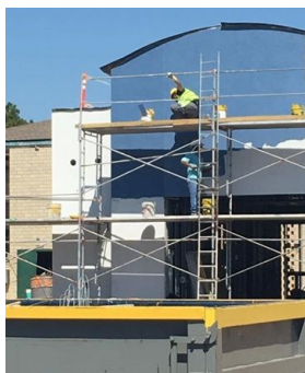
Workers paint the façade of the new Guardian Catholic School entrance

The summer is always a great time to look back on the successes of the past year as well as look forward to the exciting new opportunities in the year ahead. This past year, total enrollment at Holy Rosary and St. Pius increased by 20 percent, and the Guardian was able to provide scholarship assistance to all 420 students. I am thrilled to report that of the 24 students who graduated from our eighth grades in 2013, 96% have graduated high school this year and are enrolled in higher education.