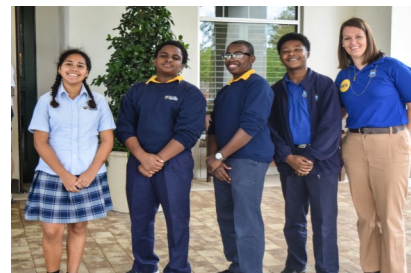
Student ambassadors from Holy Rosary and St. Pius greeted golfers during registration