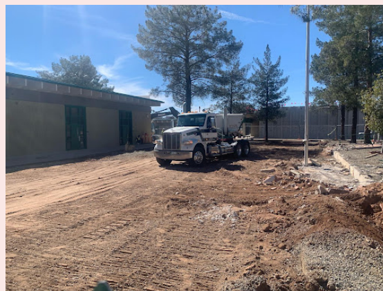
Construction is underway on the Courtyard

Taking learning outside can be difficult when teachers have to think about all of the resources they need to carry outside. By having highly functional spaces and furniture already outside, with access to electricity for technology, innovative learning will be easier to implement. The courtyard design pictured here, provides an example of the reimagined outdoor spaces.