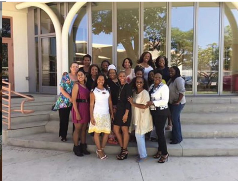
July 25, 2015