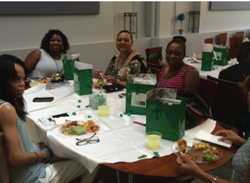
Sunday, August 16, 2015

The Red Tie Class of 1975, Green Tie Class of 1985, and Gold Tie Class of 1990 hosted their class reunions at SMA!