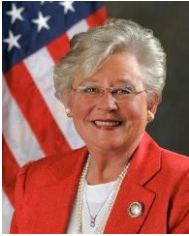
Kay Ivey, Governor President