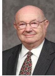
Jimmy Baker The Alabama Community College System Chancellor