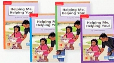
Helping Me, Helping You! (Approaching, On Level, Beyond, ELL)