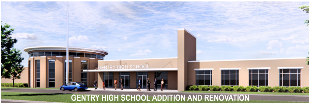
GENTRY HIGH SCHOOL ADDITION AND RENOVATION

Small projects will begin immediately and be completed August of 2022. Larger projects should be complete December of 2023.