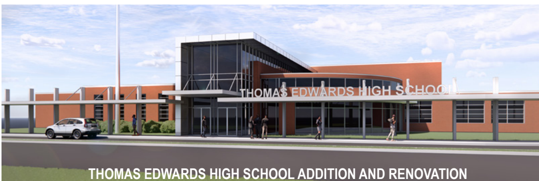
THOMAS EDWARDS HIGH SCHOOL ADDITION AND RENOVATION

"A brighter future is ours to write. Let's begin this new chapter - together."