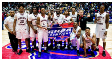
2018 State Champions