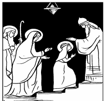
Presentation of the Blessed Virgin Mary Mon., 11/21