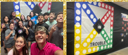
HOMECOMING HALL DECORATION WINNERS: SOPHOMORES - CLASS OF 2028