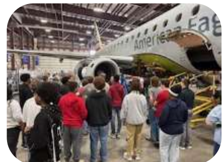
Students are shown checking out an airplane in repair.