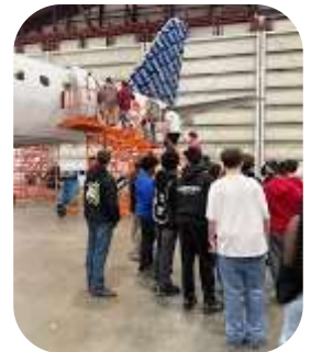
Students are pictured at right getting an inside look.