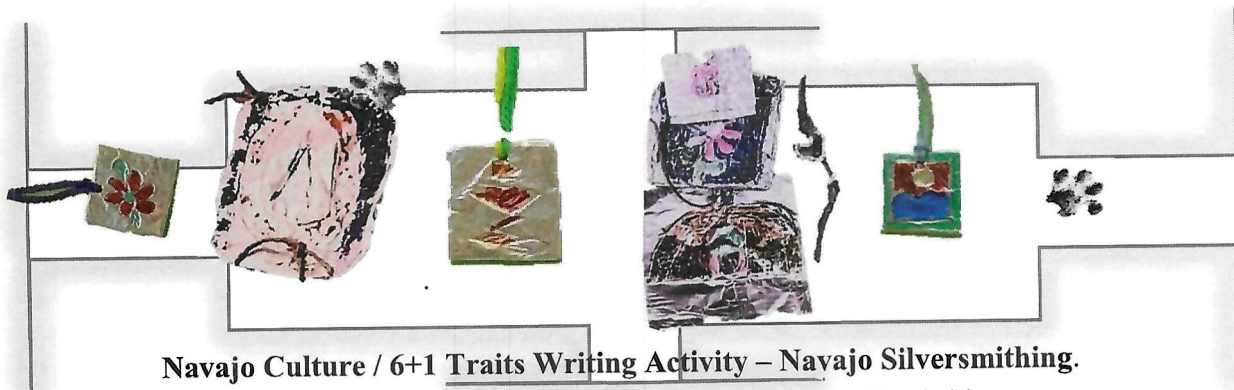
Navajo Culture / 6+1 Traits Writing Activity - Navajo Silversmithing.

So get those computers out, s-t-r-e-t-c-h your PAWS, and log into the RRDS Website.