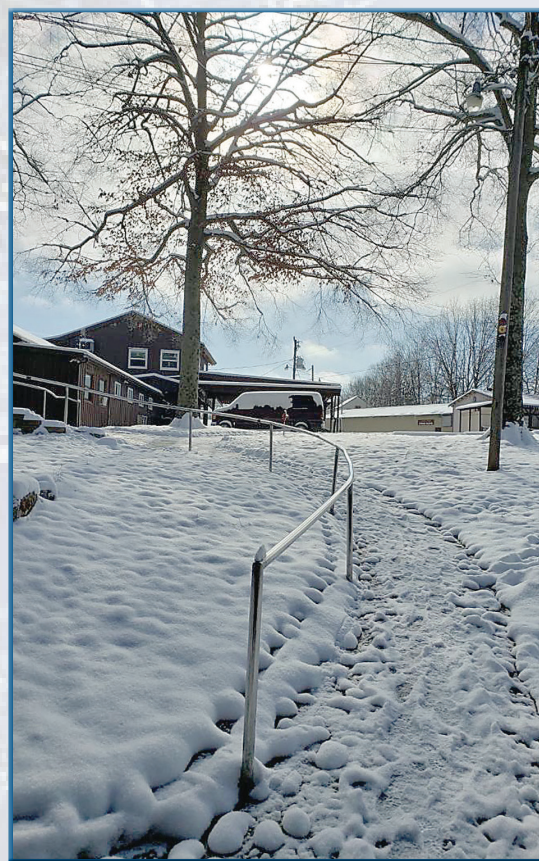
January 7, 2022