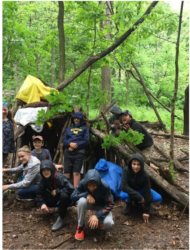
Students in Tyra's Top Dogs class group worked together to build a shelter in the woods!