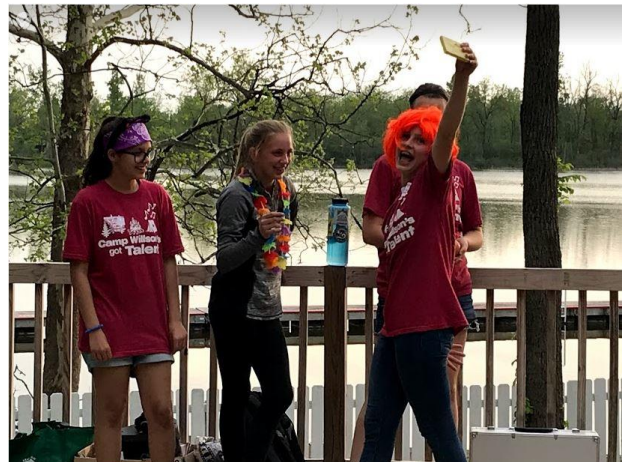
Students are performing a skit as a cabin group for the rest of their classmates at campfire!