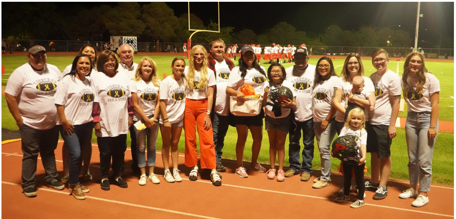
Allie's Angels sponsors from Page Lumber and Dixie Ellis Lower Antelope Canyon Tours meet with this year's Allie's Angel's recipients during halftime of the football game vs. Red Mesa.

that driving back and forth, all that time sitting in waiting rooms, gave us a lot of time to talk. And we met so many other families going through the same thing we were going through. That's when we go the idea to start Allie's Angels."