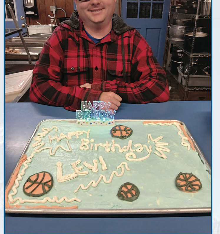
Levi's Birthday Celebration