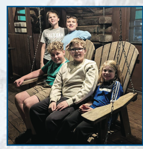
Cousins hanging out on Christmas