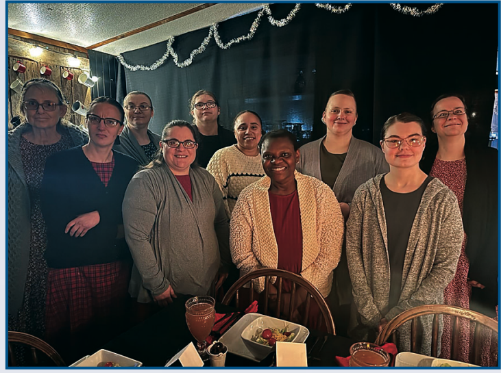
Girls' Dorm Candle Light Christmas Dinner