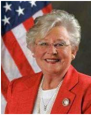
Kay Ivey, Governor President