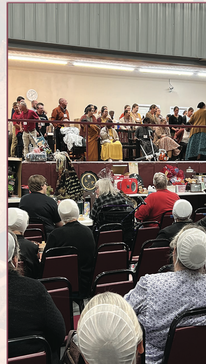
Friday Night Program

It takes a lot of work to put on a weekend like this and we couldn't have done it without the hard work of