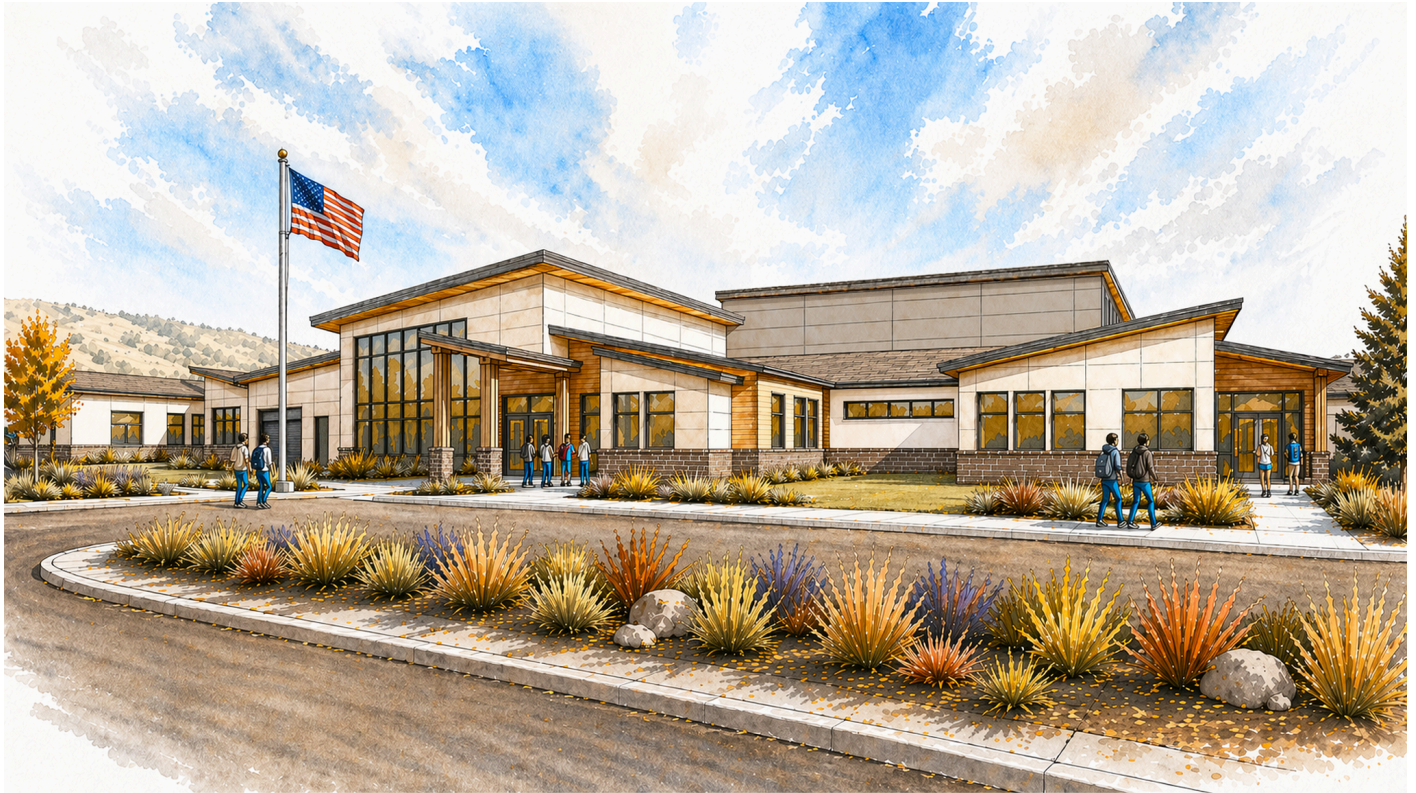
Conceptual Front Entrance

We have been working with family, staff, and community feedback about the functionality of the new school that will be built with the Fall 2026 Bond. The architects, STEELE, have been diligent to take our feedback into the floorplan process. See the floorplan below.