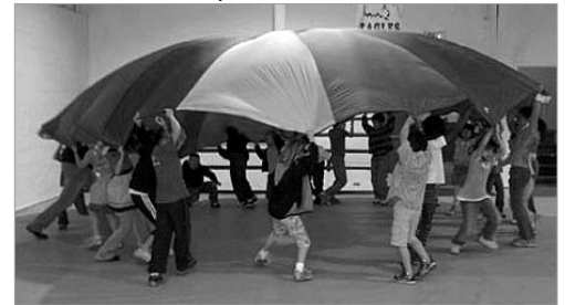
Elementary students demonstrate one of their PE activities.